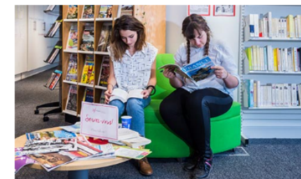
Alliance Française de Manchester

Alongside opportunities to study in France, Belgium or Switzerland, you can also study in the French Caribbean and Quebec. Full support and guidance is provided both when preparing ahead of and during the residence abroad period.